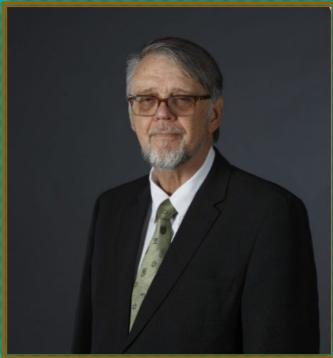
The Hon. Mr. Justice Jacob Wit Former Judge of the Caribbean Court of Justice