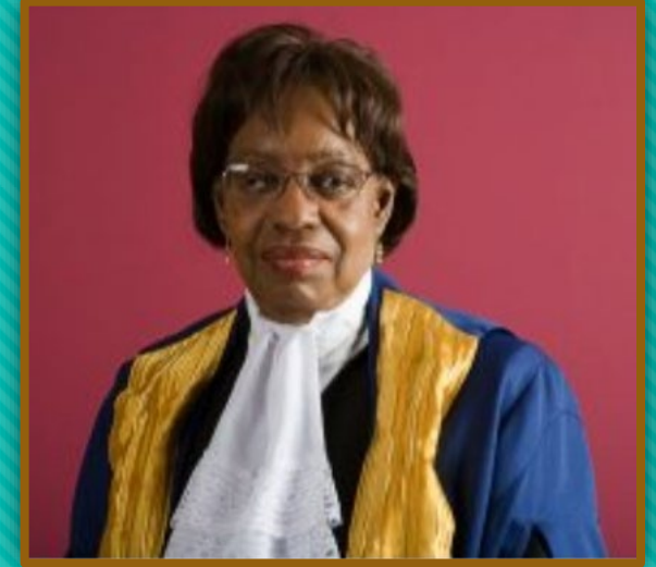
The Hon. Madam Justice Desiree Bernard Former Judge of the Caribbean Court of Justice

The Council of Legal Education mourns the passing of four giants in the development of Caribbean legal jurisprudence. Their contributions to legal education benefitted graduates of the Council's Law Schools.